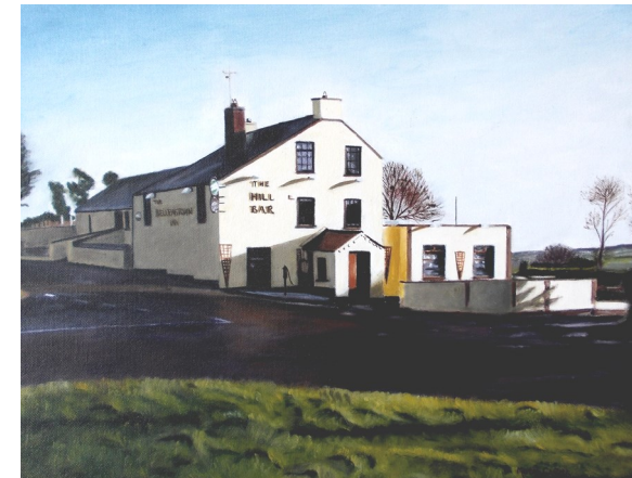
The Hill Bar — Bellewstown 14" x 18"