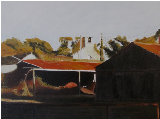
Hilltown Yard & Belltower 14" x 18"