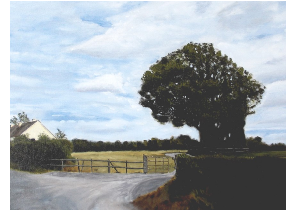
An Crann Beannaithe — Co. Tipperary 14" x 18"