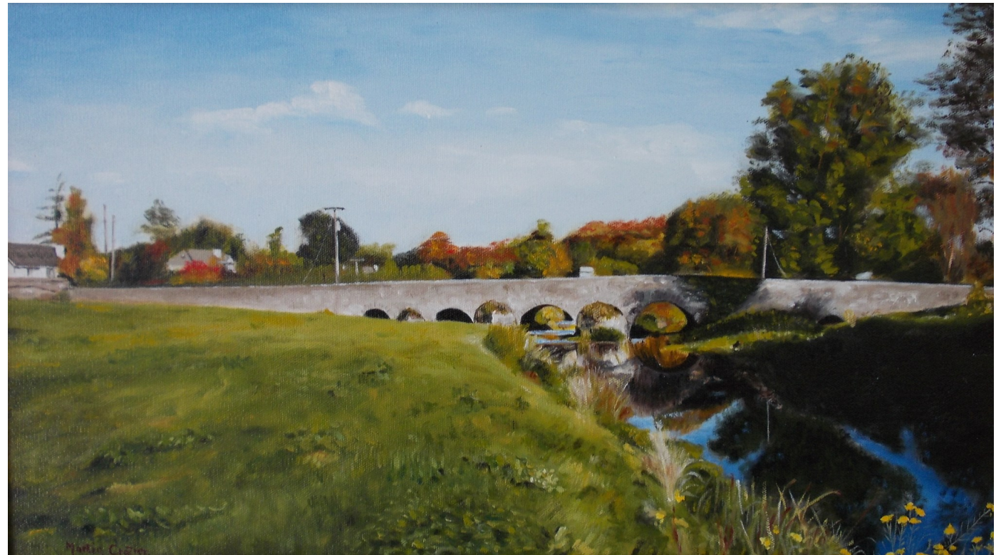
Beaumont Bridge—Bellewstown 12" x 20"