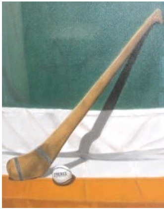
Ireland's National Game